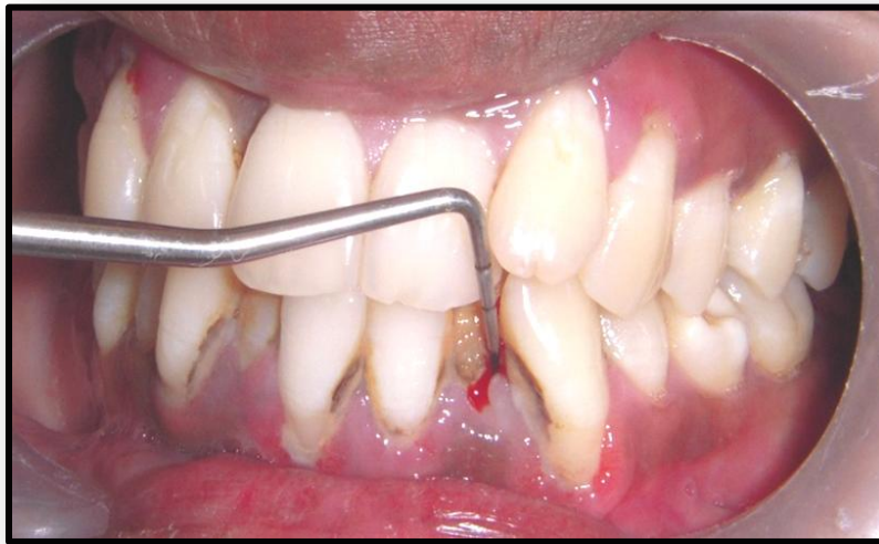
Score 3 – Periodontal Pockets 4-5mm deep