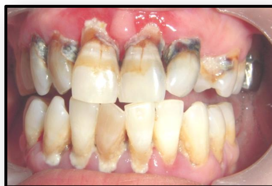
Score 2 – Presence of Calculus