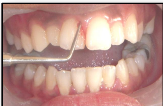
Score 1 – Bleeding on Probing