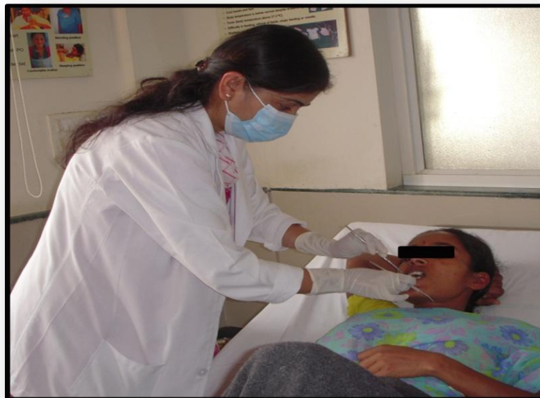
Periodontal examination of mothers