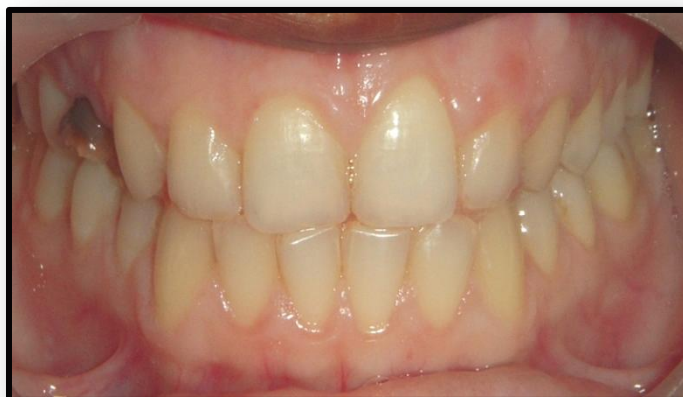
Score 0 – Healthy Periodontium