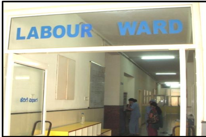
Free labour ward, KLE hospital