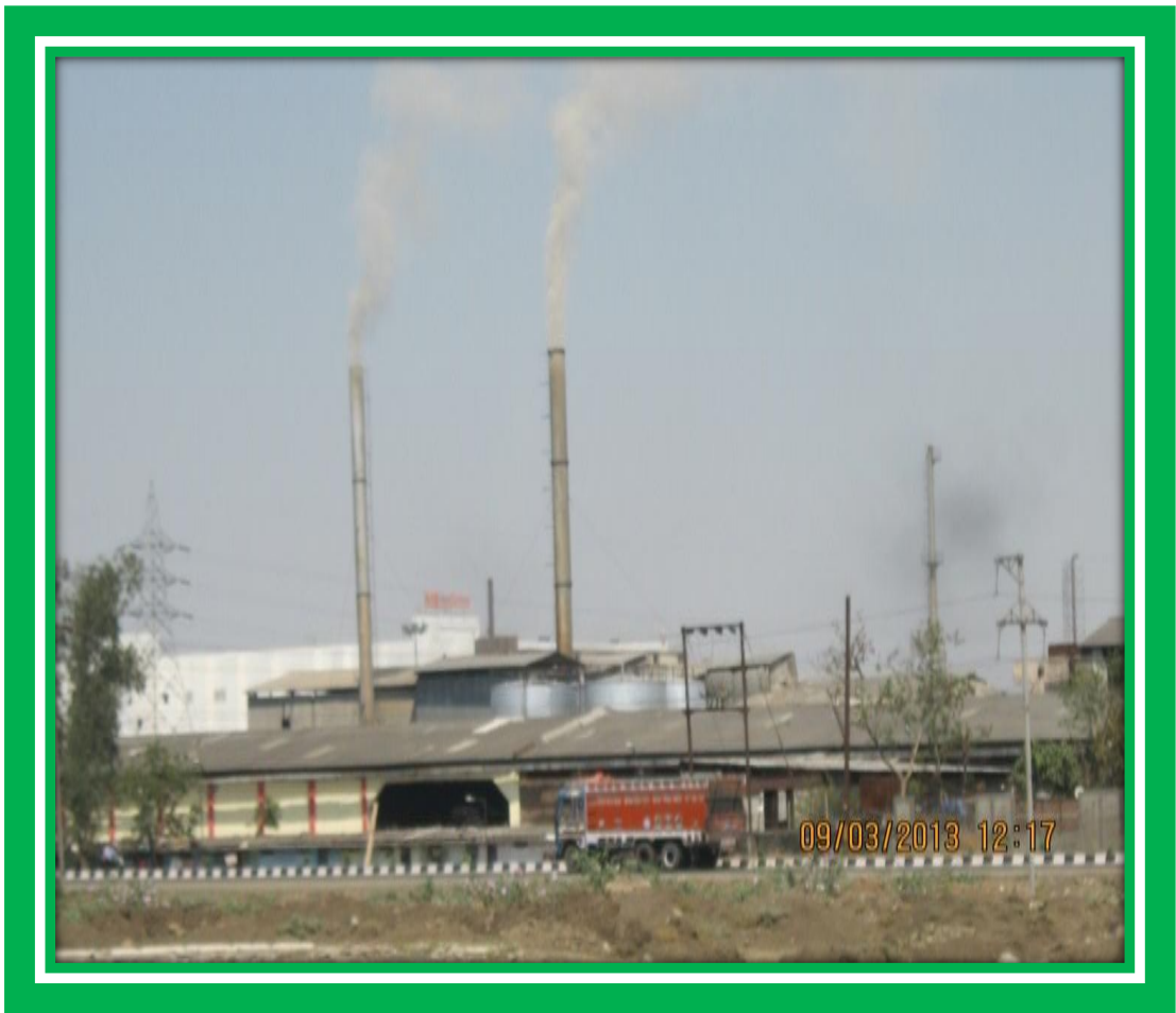
Figure: Showing highly polluted industrial area sector-3 Pithampur.